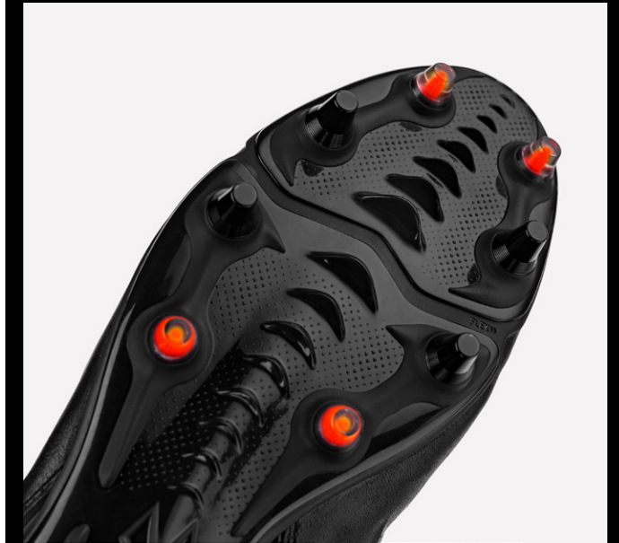
Aluminium + TPU

The studs, developed by a company specializing in metal machining in Portugal, combine durability and optimal traction. Anodized aluminum provides exceptional strength and traction - ideal for players seeking both stability and speed.